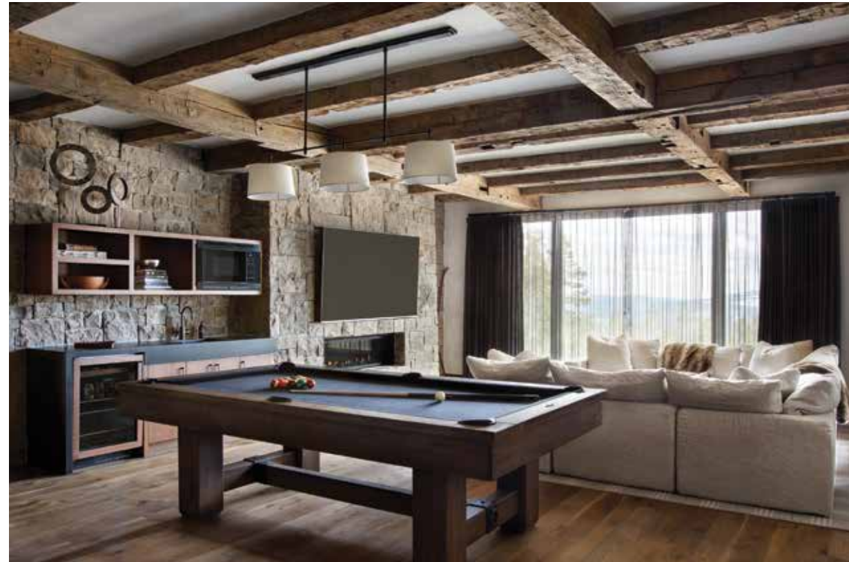
A pool table, mini kitchen, and plush sofa from Restoration Hardware’s Cloud Modular Collection create an inviting place to gather, relax, and savor the mountain views in the family’s recreation room.

Eschewing the emphatic rusticity that can come with antiques, almost all of the home’s interior furnishings and