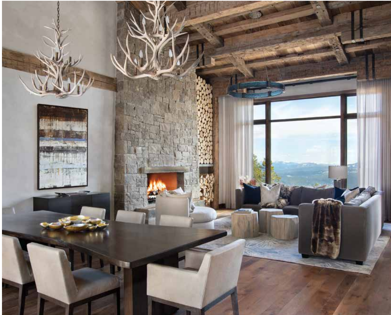
ABOVE: Old-surface wood, reclaimed from a pair of 140-year-old barns, lends warmth and character to the main living area, and sun-bleached antler chandeliers hang above the live-edge walnut-slab dining table. OPPOSITE PAGE, FROM TOP: Stone and timbers used on the home's exterior penetrate through the entryway's interior walls, creating a cohesive flow of textures. • Perennial succulents planted on the flat sections of the roof allow the house to blend in with the surrounding landscape when viewed by neighbors above.

the avian wildlife, but “so the resident up above isn’t looking down at a giant expanse of roofing material,” explains architect Nate Heller, principal of Studio H Design located in Bozeman. “It’s a little bit more friendly to them.”