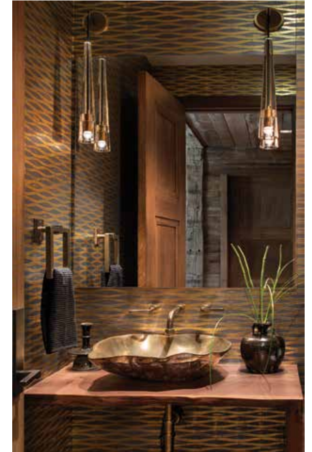
CLOCKWISE FROM TOP LEFT: The ski room features lockers and hooks for equipment, making it easy to ski in and out of the property. • The organic, botanical shape of a brass bathroom sink echoes the abundant natural beauty that exists inside and outside of the home. • Style and substance unite in these built-in bunk beds. • Featuring a chandelier and a traditional Japanese soaking tub, this bathroom in the homeowners’ suite serves as a dreamy retreat after a day on the slopes.