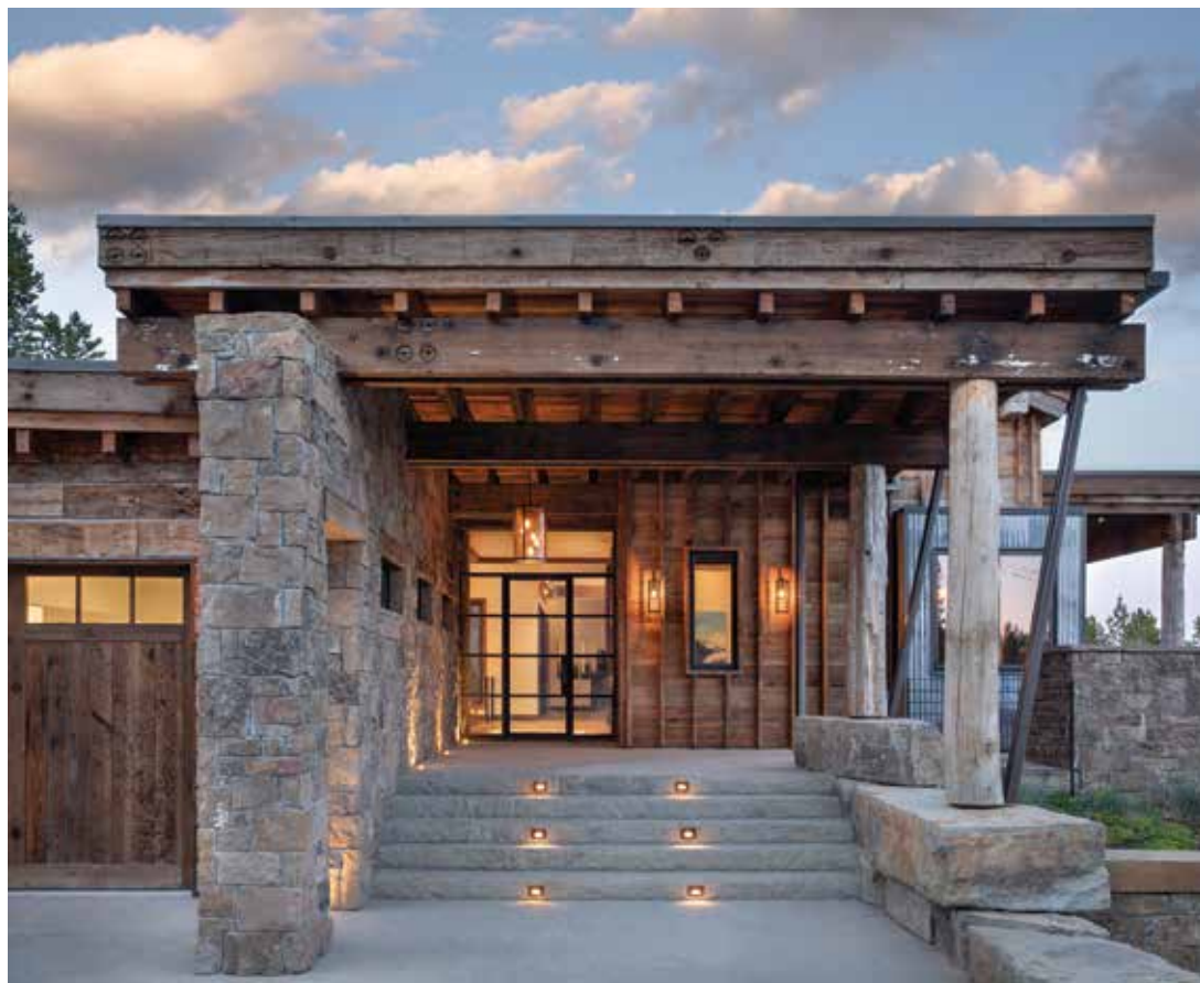
ABOVE: With a mix of heavy stone and reclaimed timber, along with a modern glass front door, the entryway establishes the harmonious blend of textures that exist throughout this home in Big Sky, Montana. OPPOSITE: In the home's modern kitchen, the warm brown tones of the wood cabinets are offset by creamy white surfaces and illuminated by artful, custom light fixtures.

T O THE BIRDS GLIDING ABOVE YELLOWSTONE CLUB IN BIG SKY, MONTANA, one home might appear to be a cluster of small buildings — a somewhat anomalous sight. This is, however, an illusion accomplished by ingenious design. Sections of the 5,700-square-foot home's roof are flat, covered with soil, and planted with perennial succulents. When viewed from above, a sizable portion of the house blends in with the green, forested landscape. The purpose was not to delight or trick